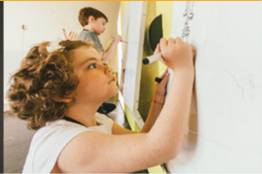
IS THIS CONTAGION?

In addition to cells, there are millions of bacteria, fungi and viruses in our body. This scale will reveal how much of our weight isn't really yours.