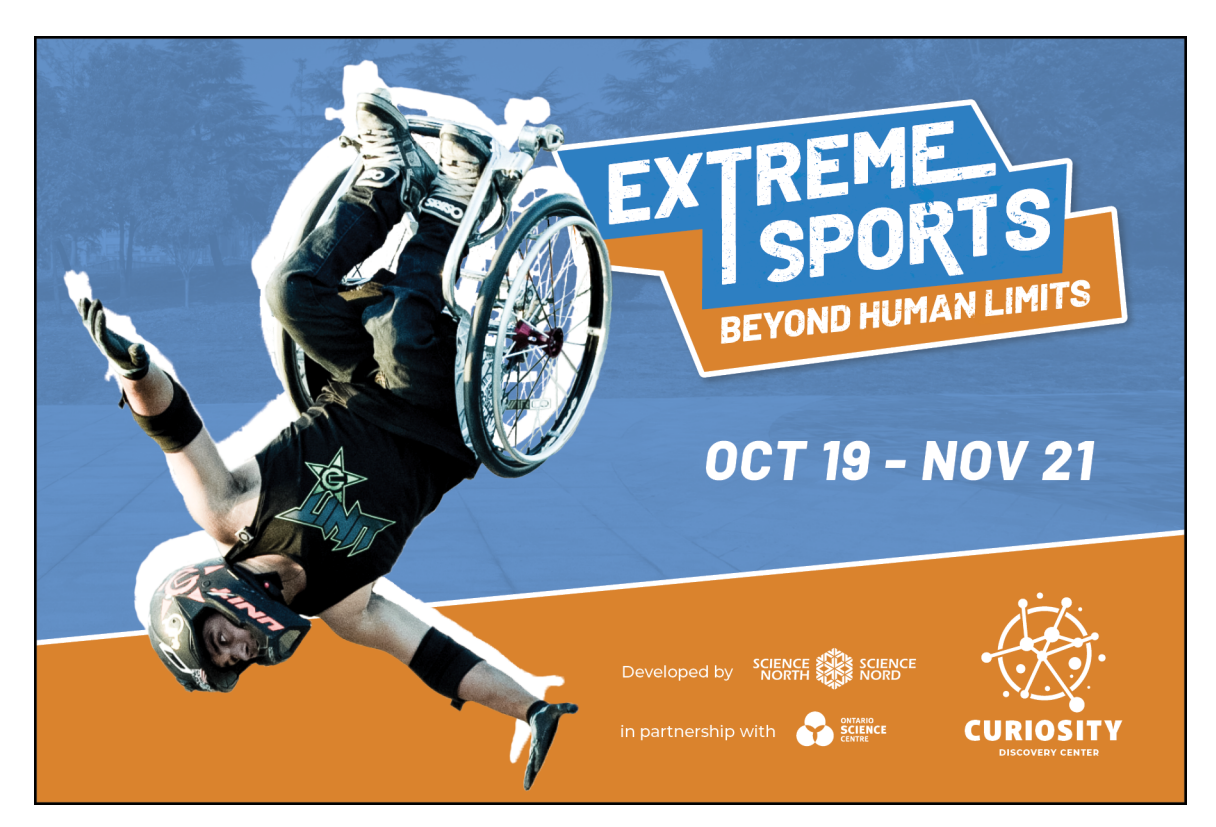
Design starter for 6 x 4" print ad

Quick start design files incorporate placeholder logos for your organization; just replace them with your own logo. You may use this creative or further adapt to your brand within these guidelines. In all cases, creative approval is required (please see page 12).